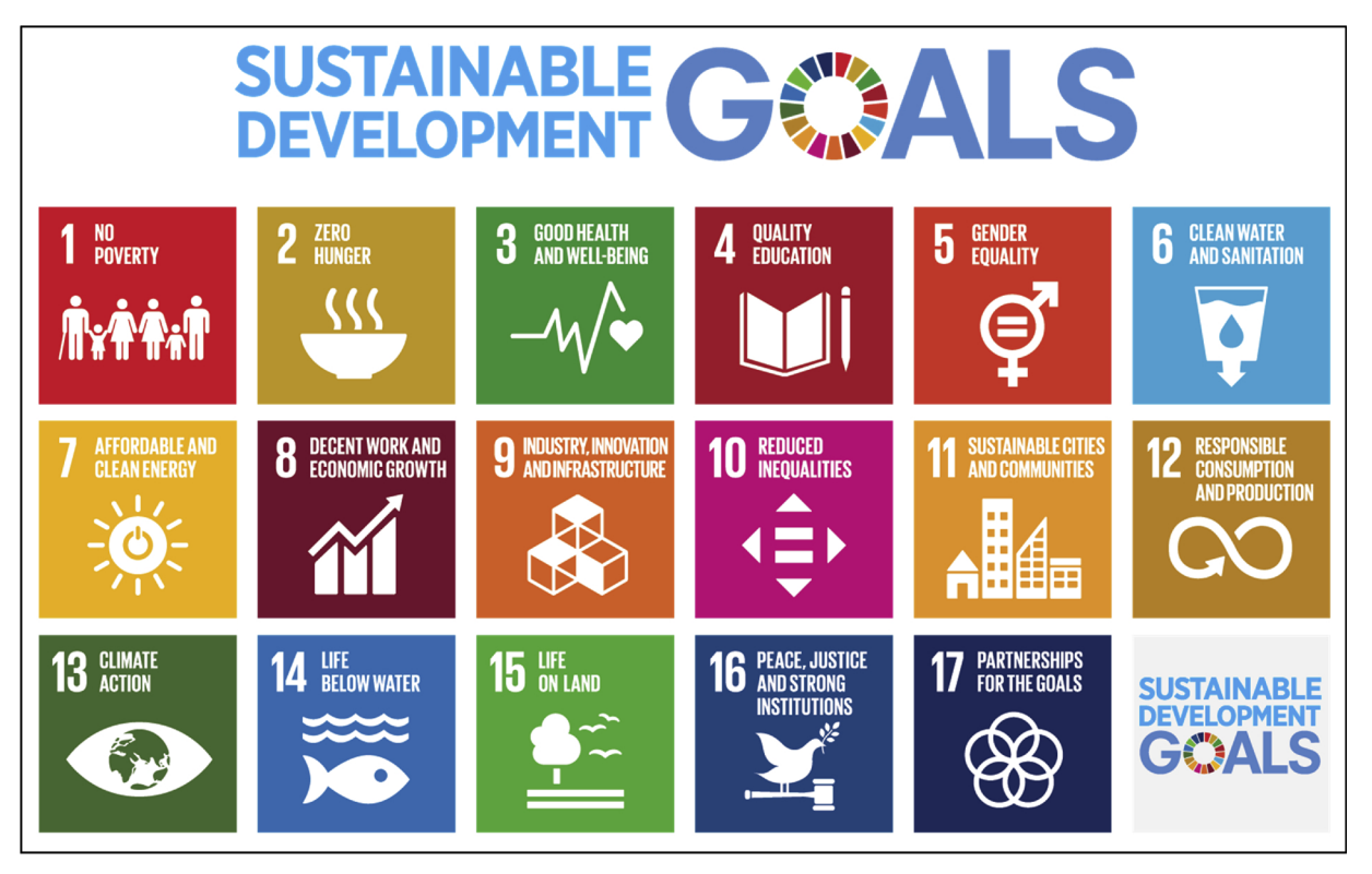
Fig. 3. Sustainable development goals (www.un.org/sustainabledevelopment).